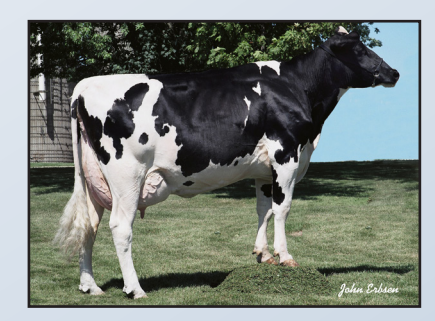
DA-SO-BURN MTOTO BRITANY