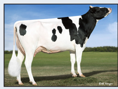
DA-SO-BURN DORCY BECKA-ET