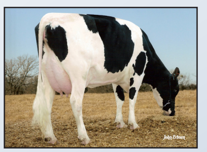
DA-SO-BURN OMAN BRANDY-ET