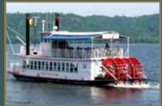
PHOTO: PEARL OF THE LAKE