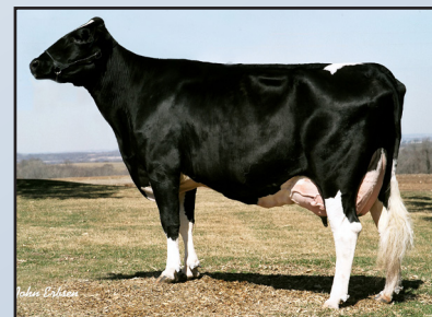
LONG-HAVEN RUDOLPH DEE-ET