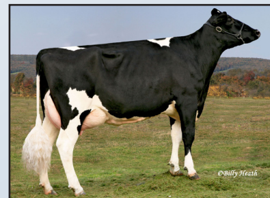
COOKIECUTTER GLD HOLLER-ET