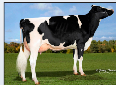
COOKIECUTTER MAC HALMACI-ET