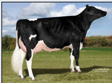
COOKIECUTTER MOM HALO-ET