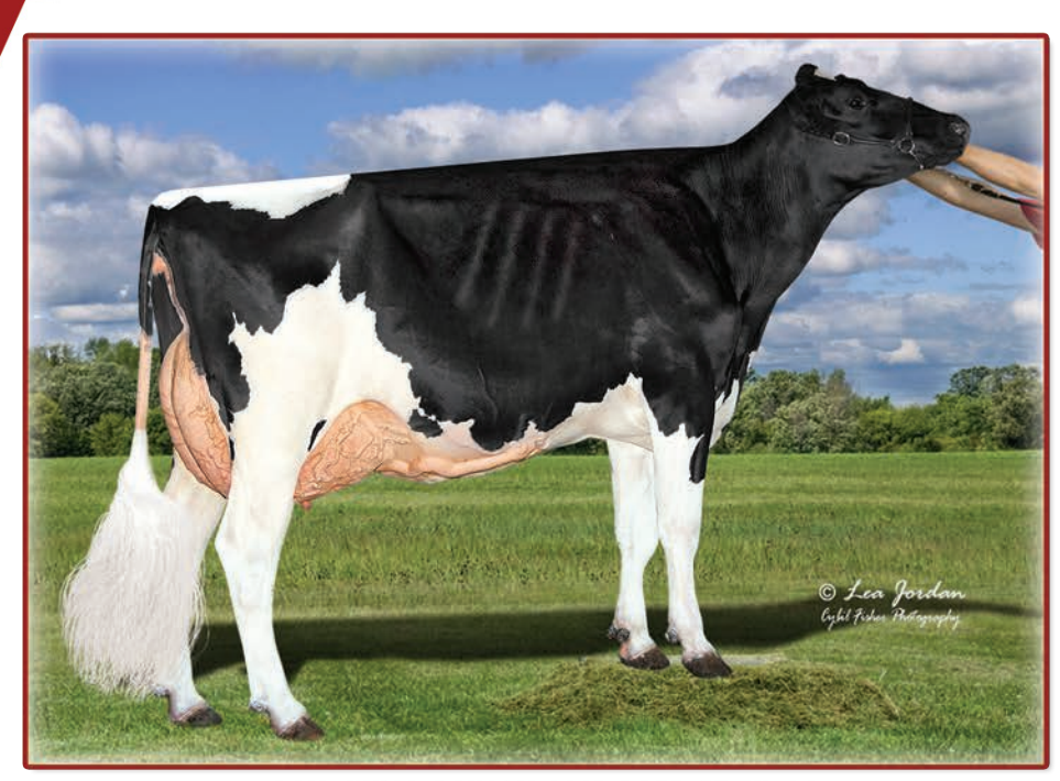
DAM: KINGS-RANSOM CASP DAZE-ET EX-94

840003236793974 99%RHA-I aAa:231465 A1A2 AA TR TP TC TY TV TL TD FREE OF ALL HAPLOTYPES IMPACTING FERTILITY