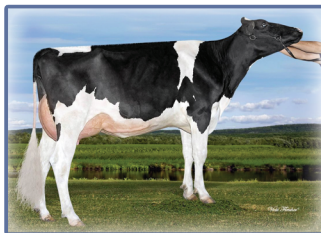
2nd Dam: AIJA KING-DOC WICHITA-ET VG-88 CAN