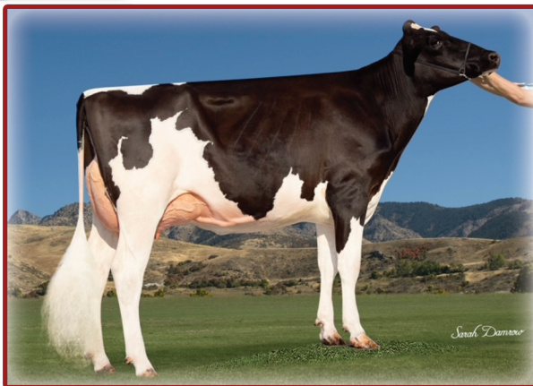
DAM: MS AIJA MIRAND MYLAND-ET VG-86