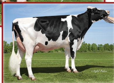
DAM: DEWGOOD 720-816 CASHIER-ET GP-82