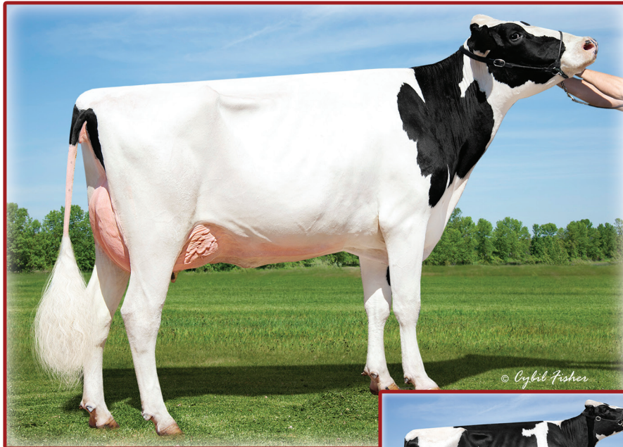
3RD DAM: SPEEK-NJ T JOYFUL-ET VG-85 DOM