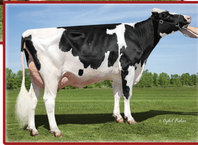
DAM: DEWGOOD 720-816 CASHIER-ET VG-86