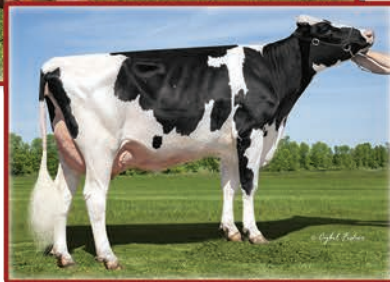
DAM: DEWGOOD 720-816 CASHIER-ET VG-86